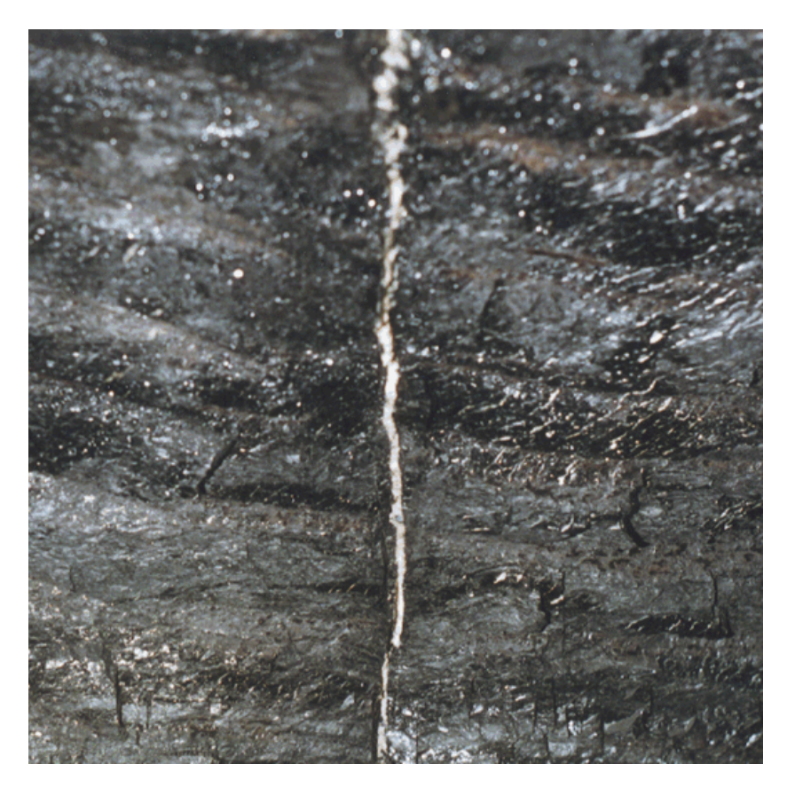
Photo 1 A hydraulic fracture propped with white sand in the roof coal at Dartbrook Coal Mine, NSW.

By placing sufficient proppant in a hydraulic fracture that extends a sufficient distance, a conductive channel is formed in the coal seam that acts as a conduit for the water and gas to travel along. The fracture faces expose a large area of the seam to the lower producing pressure, allowing the water and gas to drain directly into the propped fracture at an accelerated rate. Hydraulic fracture treatments are designed to place a propped conductive fracture in the coal seam that will efficiently stimulate production from the seam. The stimulation effect achieved depends both on the conductivity and size in length and height of the fracture and on the permeability and thickness of the coal seam. Effective stimulation of a low-permeability seam requires longer moderate conductivity hydraulic fractures, while stimulation of a high-permeability seam requires shorter high-conductivity fractures.